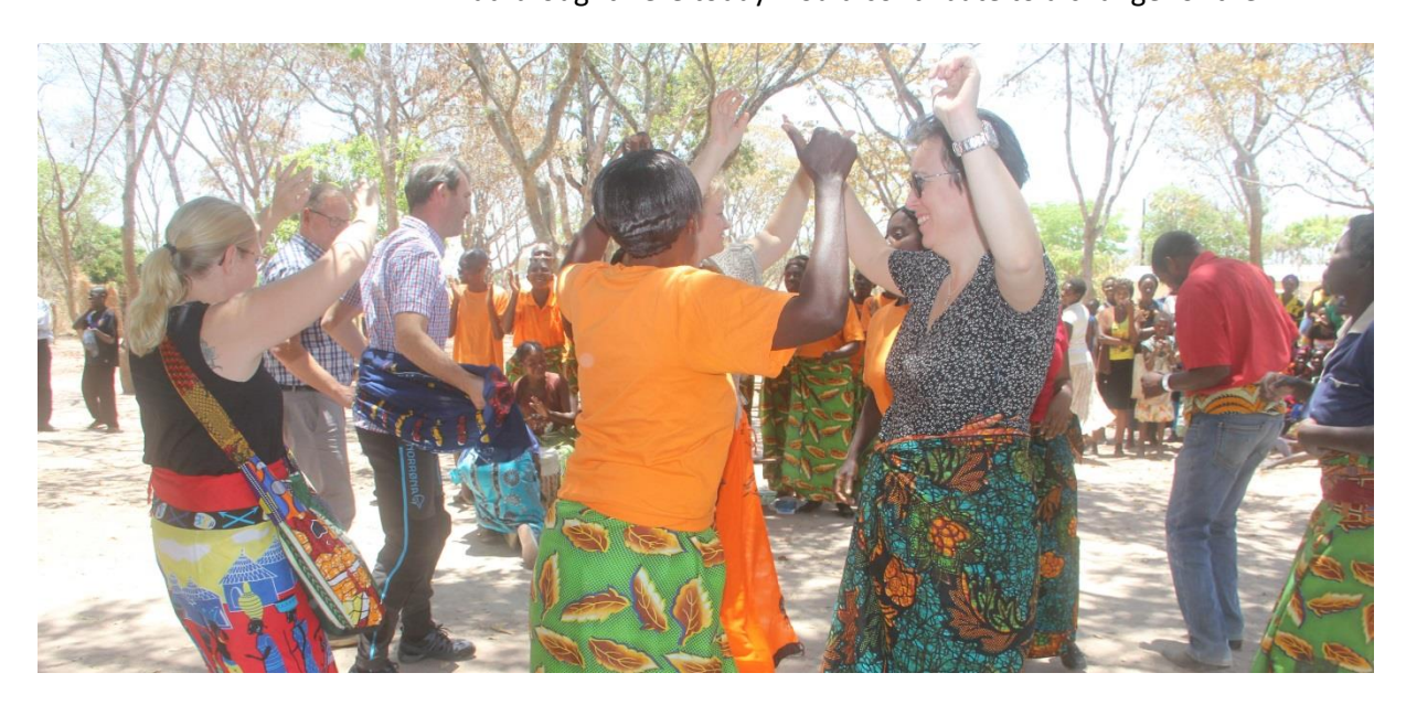
No meeting without a dance- something to be introduced at home?

There is a big need for a secondary school in order to empower the girls and avoid early marriages. Most people talked about the same things, about the need of development, about the effects of poverty and the despair they felt. The challenges are many and the resources are extremal limited. And even if we stressed that we did not bring them anything there was a hope that the Swedes Ian had brought here today would contribute to a change for them.