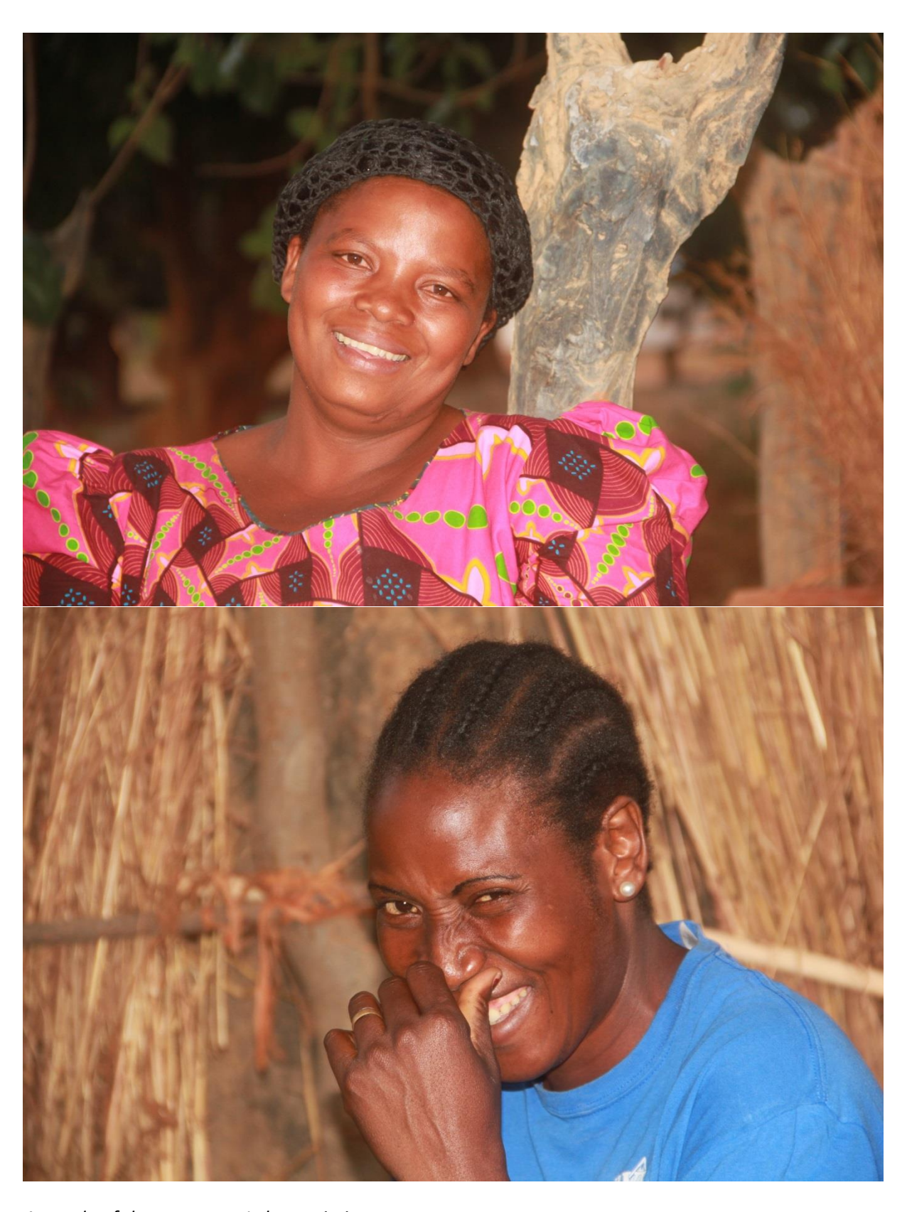
A couple of the women at Lubwa mission