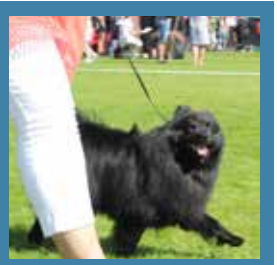
DOG SHOWS Piteå offers many high-class dog shows, both nationally and internationally.