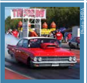
MIDNIGHT SUN DRAGFESTIAL Midnight Sun Dragfestival at Piteå Airfield as base for dragracing competitions.