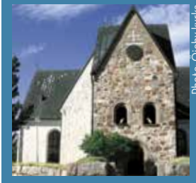
ÖJEBY KYRKMARKNAD Öjebyn Piteå old town with markets around the beautiful church both summer and winter