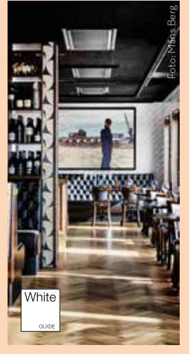
RESTAURANG TAGE Hamngatan 60, Piteå www.restaurangtage.se

RESTAURANG GOLDEN DRAGON 0911-15922 Storgatan 72, Piteå www.golden-dragon.se