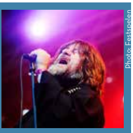
FESTSPELEN Festspelen in Piteå attracts an audience from the entire Sweden with high quality and original music.