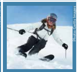
LINDBÄCKSSTADION Lindbäcksstadion sports with long-distance and downhill skiing, world-class biathlon and ski orientation