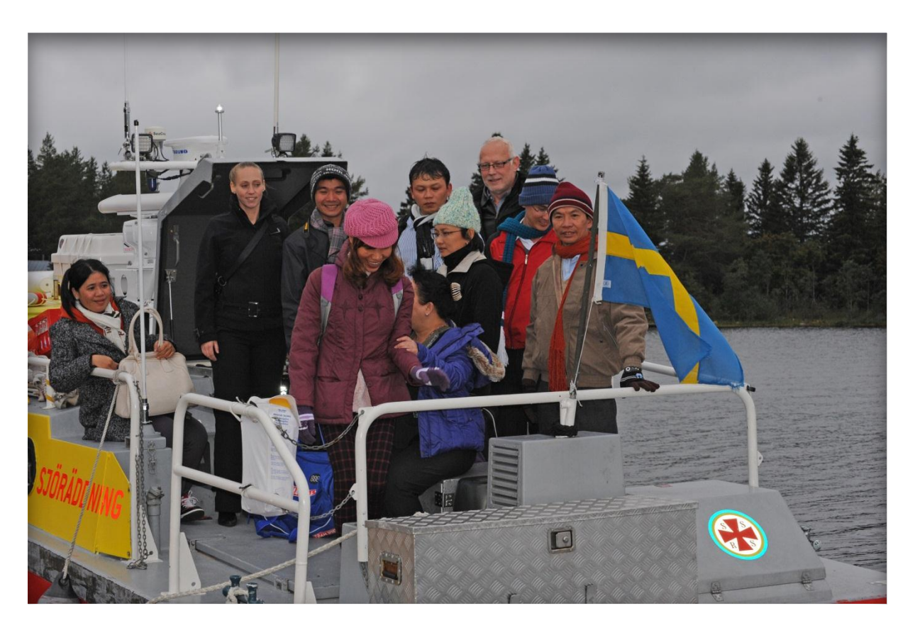
A rescue boat brought us to Svinöra (Pigear) where the boat club has a club house

The first afternoon we spent by doing a common exercise with a theme "working in international relations". The first part was labeled "what are the challenges we are facing" and the things brought up were; languages/pronunciation, time differences, distance, cultural differences/backgrounds, different working processes, different view, find time for work and the project and lack of confidence.