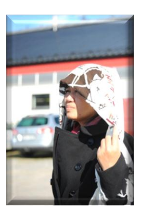
A fieldtrip to a couple of farmers was on the program. At one a small bio gas plant was under construction which would make the farm self-sufficient