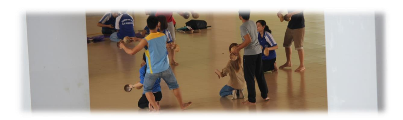
Students are practicing traditional dances for a celebration at the University