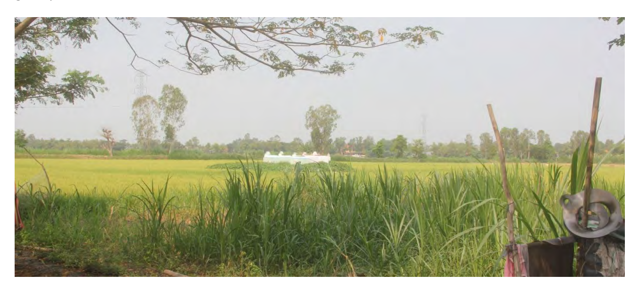
A common sights along the way is family graves in the middle of the rice field

To go by car from Ho Chi Minh City to Long Xuyen is like being in a movie for 6 hours. 200 km takes 6 hours, if you include a break on the way. One small town is often merged into another and there is not much space between the houses in the villages and towns along the way. Behind the houses, and now and then between villages there are rice fields and here and there are small private graveyards in the middle of the fields.