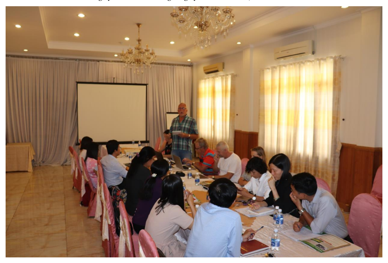
The key members of the project had a review meeting with the following discussion and agreement: