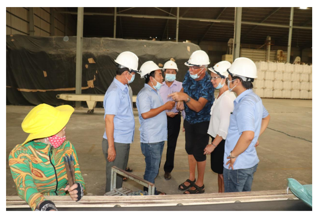
• Visited An Giang BioTech center