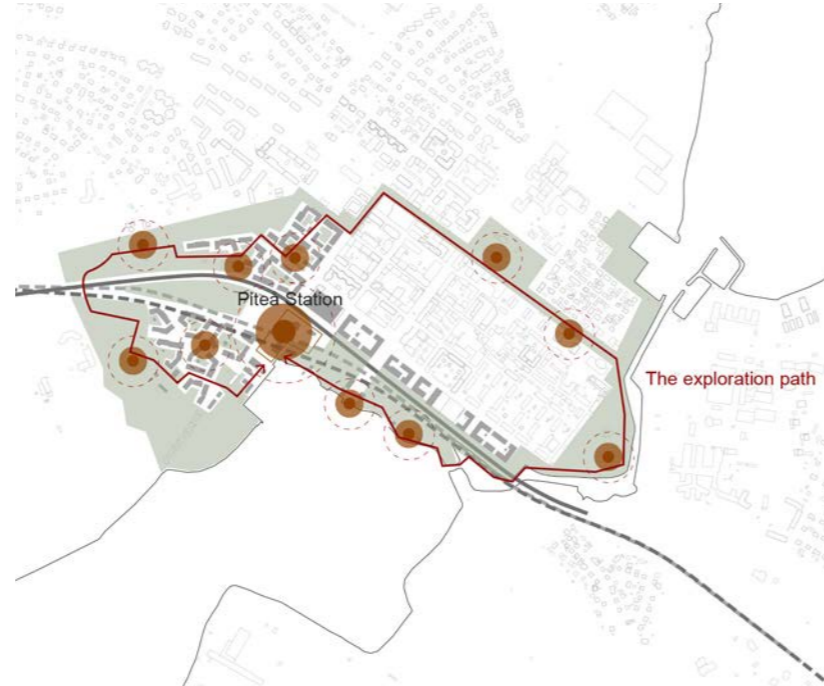
ANCHORPOINT AND EXPLORATION PATH The exploration path within the green ring connects the existing city with the new districts. Along the path there are different types of social meeting points creating various urban spaces and experiences, supporting many different diverse communities.

swimming, rowing or ice skating can take place, and such are accommodated through sheds and bridges. Biodiversity should be enhanced as some areas are kept wilder and more diverse. All year-round locals and visitors can enjoy events in the new cultural hub. The beautiful view towards the inlet can create for a magical setting in which communities of all ages can emerge – visiting theatrical groups can take residency here, local dance schools can perform and seasonal concertos can lure people from the upland in.