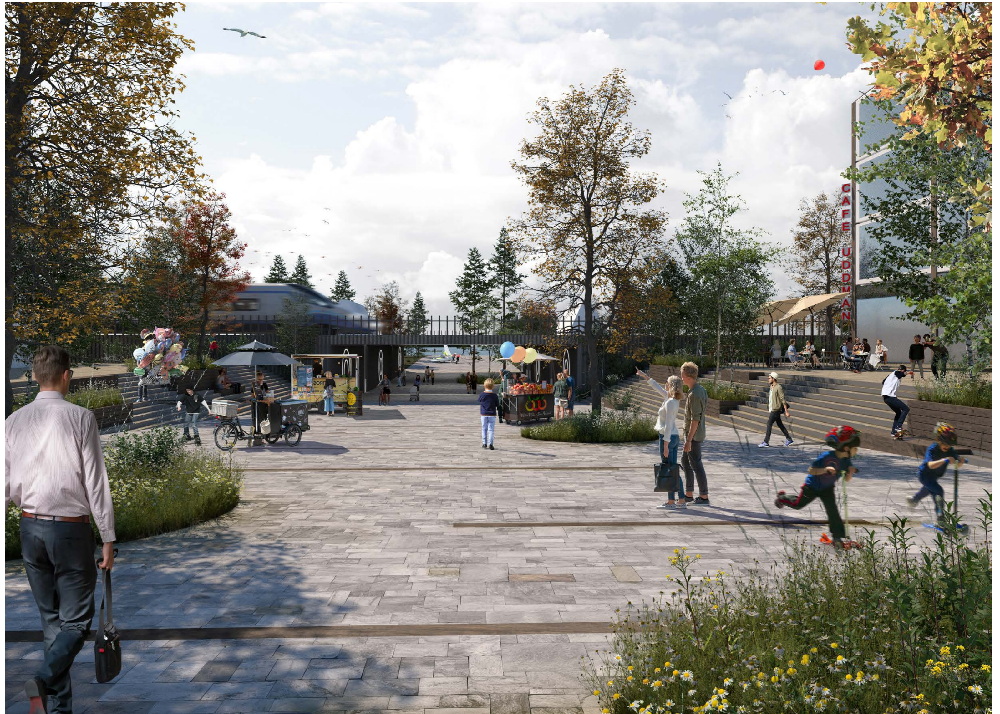
New underground connection transforming Uddmansgatan into a lively urban space that can host markets or serve as an art space. It maintains the important sightline towards the waterfront and links to the new cultural hub and recreational park along Sörfjärden.