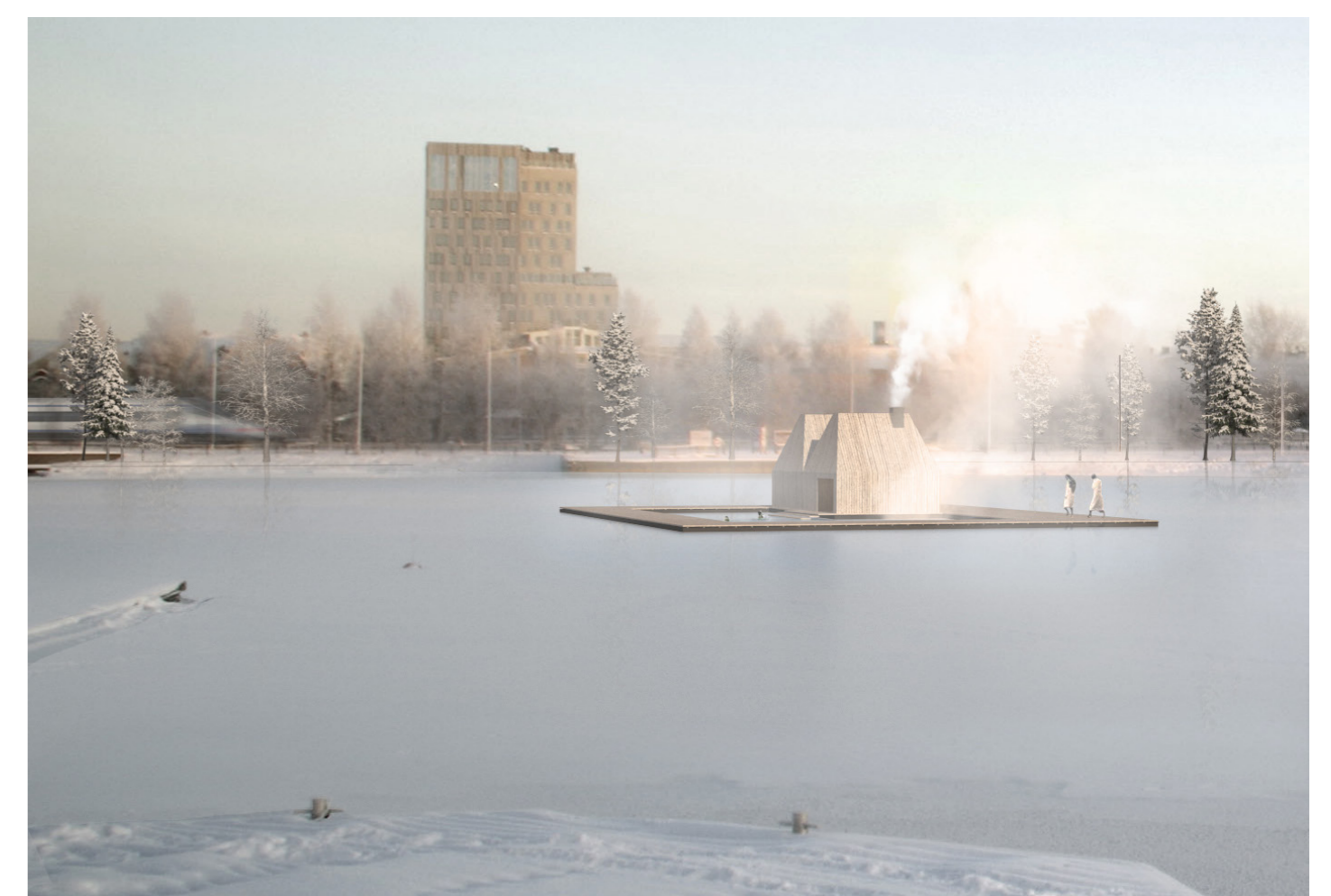
A new sea bath in Sörfjärden gives life to new communities in Piteå and creates contrast to the high speed trains passing by.