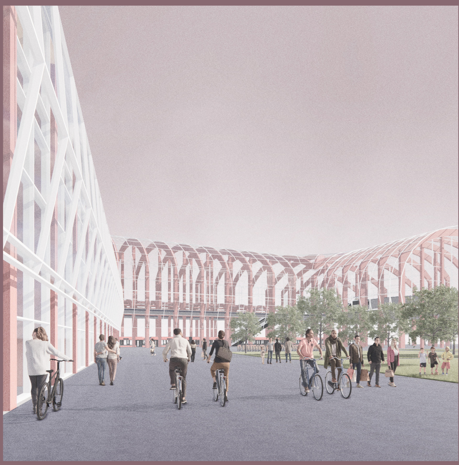
VIEW OVER THE MAIN ENTRANCE AREA